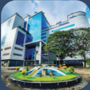
Kochi (Head Quarters)