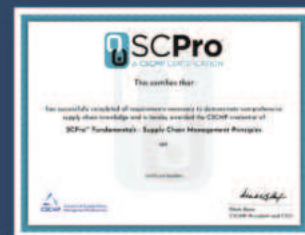
SCPro™ Level One Certification (PAID)