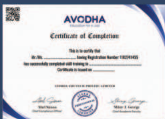
AVODHA Course Completion Certificate (UNPAID)